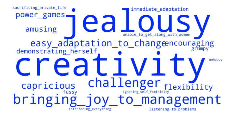
Figure 1. Word cloud of Female Participants in 2008

In the second periphery and distant peripheral zone, female employees' evocations are mostly negative, such as "fussy", "grumpy", "unable to get along with women", "interfering everything", "ignoring self-femininity", and "unhappy". Similar to male employees, negative evocations are also present for female employees, such as "bringing private life to work", "mixing up work and emotions", "scatterbrained", "mind being occupied by housework", "unable to handle the work and marriage together" and "disrupting the work order". Few positive evocations are also present in second periphery and distant peripheral zone such as "immediate adaptation" and "listening to problems" both indicating attributed adaptation and communicative capabilities for woman managers.