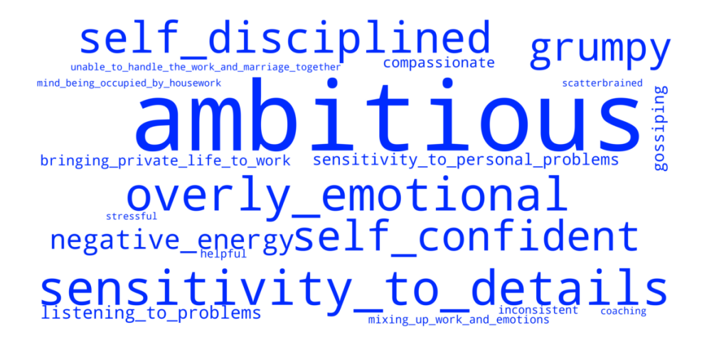
Figure 4: Word cloud of male participants (2018)

Most of the social representations in the distant peripheral zone are negative in both 2008 and 2018. For female participants, social representations such as "the disability to get along with women", "sacrificing her private life", "unhappy", "forgetting her own femininity" were present for women leaders in 2008. In 2018, "stubborn" was also added to these representations. When it comes to male participants, social representations in 2008 were conflict between private life and the work-life conflict that emerged in the distant peripheral zone. The representation of "psychologist" for male participants in 2008 was replaced by "coaching" in 2018 as well.