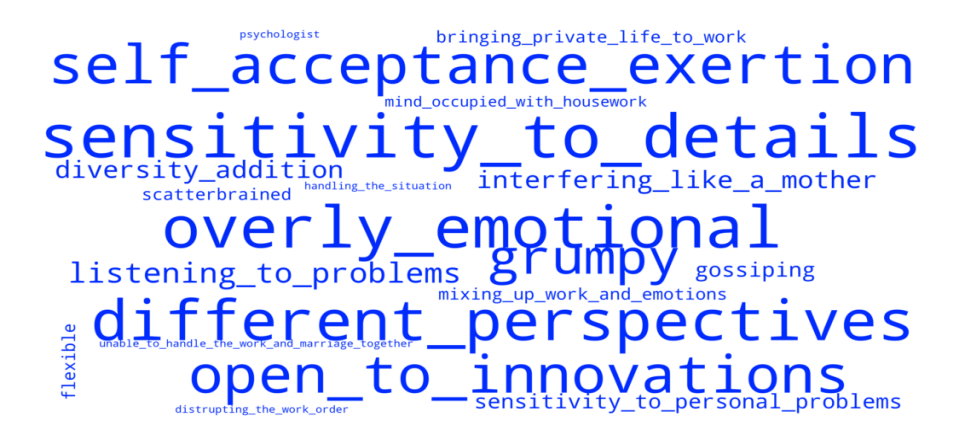
Figure 2: Word cloud of Male Participants in 2008

When central nucleus evocations from 2008 and 2018 are compared, an increase in the negative evocations of the participants was observed in 2018. Evocations such as "ambitious", "aggressive", and "manipulator" are the most frequent ones among female participants in 2008, while these do not exist in 2008 data. Male participants evoked "ambitious", "grumpy", "negative energy" about woman managers. Figure 3 and 4 respectively represent the generated Word cloud for the responses of female and male participants regarding women managers in 2018 as well.