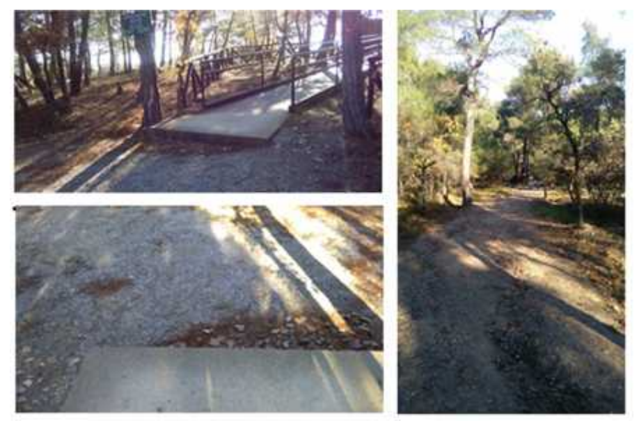
Figure 9. The Ramp Problem for Disabled People (Tachir, 2016)

The problem of transportation for disabled people (pedestrian trail lines) shows that the acceptance of human-friendly universal design is partially applied in Dadia area. The ramp in reaching the bird watching tower has been partially applied and no ramp has been considered on returning pedestrian track (Figure 9). It is seen that ramps and resting points for the disabled have not been considered in yellow, orange, red and blue tracks which are the pedestrian track lines. Birdwatching pedestrian tracks and other pedestrian track lines are on the slope that the disabled people can easily reach (10%), have safety bars and are made of pliable, light-structured and unfounded constructions.