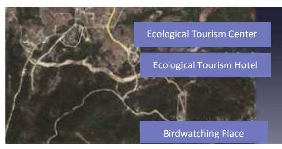
Figure 4.Information Center, Accommodation Unit and Birdwatching Tower Locations (The Dadia Forest National Park, 2016).

In Dadia, an office of the World Wildlife Fund (WWF) was established for the preservation of the field in 1980. The foundation, aiming to ensure the sustainability and economic prosperity of the Dadia region, firstly decided to build Dadia ecotourism center, which would be a focus point for visitors, in Dadia area and the center was completed in 1988. Dadia ecotourism center consists of the Information Building, Accommodation Unit, Birdwatching Tower and Pedestrian Tracks (Figure 4).