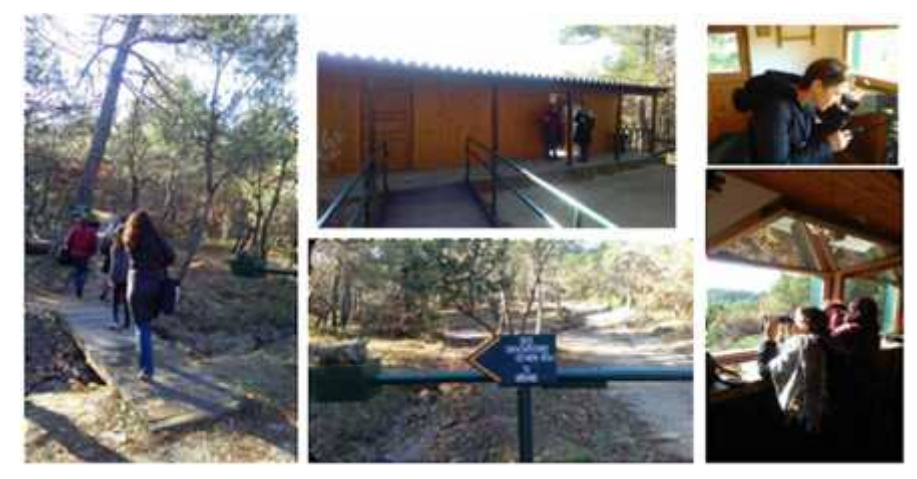
Figure 7.Bird Observatory (Tachir, 2016)

Pedestrian Track Lines; In Dadia Center, there are four hiking lines with different difficulties and lengths (Table 3).