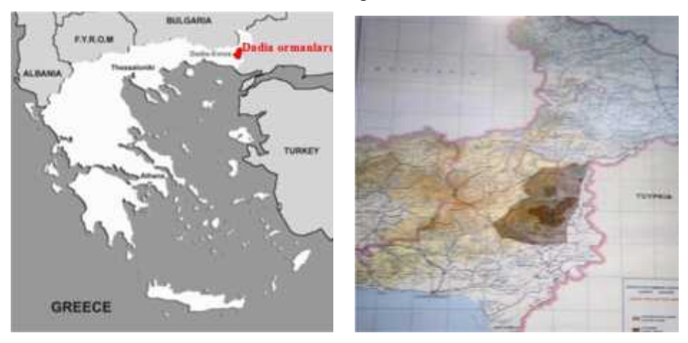
Figure 2. The Location of Dadia Forests in Greece (Map of Greece 2016), Dadia Forest.

The Dadia forest, located in Evros province in the north-eastern part of Greece which is in the eastern Macedonia and Thrace region, is an important ecological field in which the natural ecosystem cycle is experienced and it has been preserved as a National Park in cooperation with INCN\WWF since 1980. The total protected area of the Dadia forests is 42,460 hectares. All uses are prohibited on 7.290 hectare core area of forests and it is defined as first-class protected "Absolute Nature Reserve/Wild Area"(IUCN, 1994), (Figure 2-3)