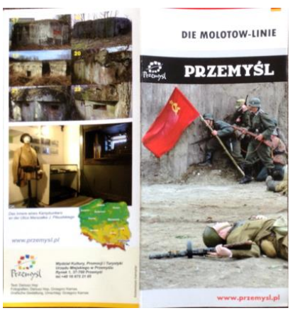
Fig. 1. Example of the exploitation of the border – brochure on visiting the Molotov-Line

Source: Photo by the author 2014, Brochure: City of Przemyśl